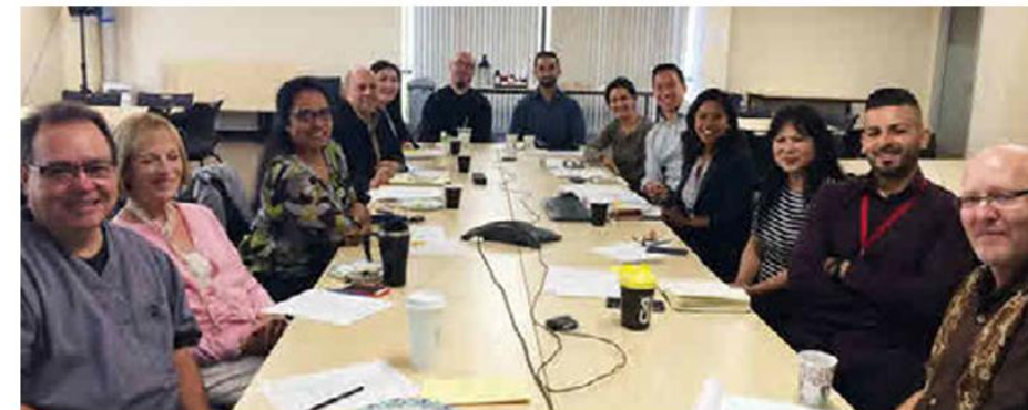
Picture 15: HTHC partners in Alameda Health Consortium Dental Directors' Meeting